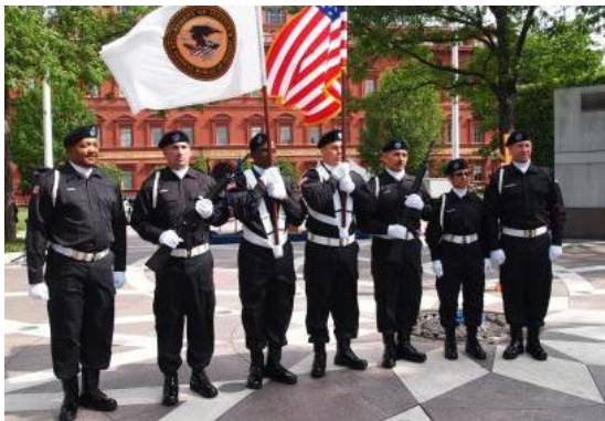
Central Office Honor Guard