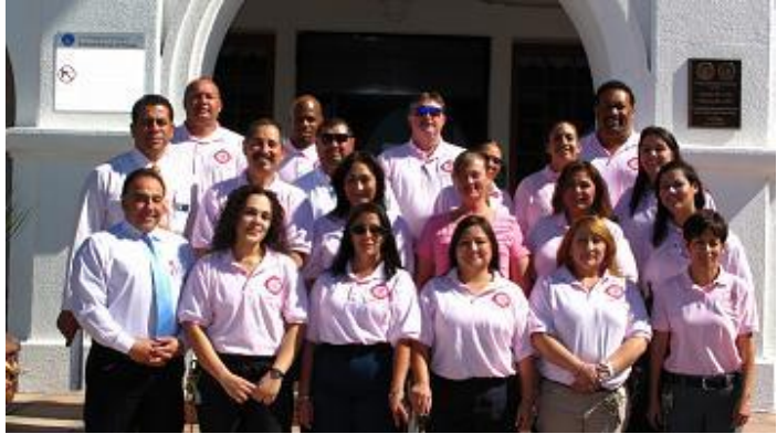
FCI La Tuna staff show their support for breast cancer awareness

by wearing a "BOP Breast Cancer Awareness" polo shirt once a week.