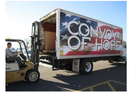
Loading donations on Convoy of Hope truck

theCan" food drive. The Convoy of Hope procurement coordinator noted, "It is through great partnerships like this one that we are able to help so many people in need."