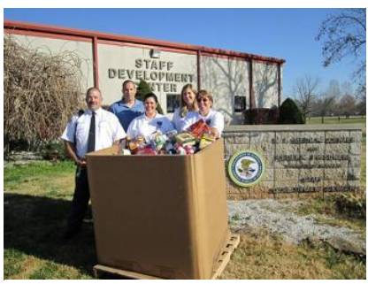
MCFP Springfield with food donations

During this holiday season, MCFP Springfield staff have found several ways to help the local community. The annual Veterans Day luncheon raised more than $800 for "Warrior Wives," an