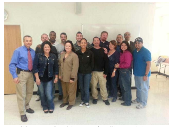
FCC Tucson Spanish Immersion Class participants

During the week of December 3-7, FCC Tucson held a Spanish Immersion class for staff. Due to the large number of Hispanic inmates housed at FCC Tucson, it is especially important for staff to be able to effectively communicate with this population. Along with basic grammar, the training emphasized commands and expressions to manage inmates, as well as recognition of words that may pose a concern for staff in a correctional setting. The class provided staff the opportunity to practice basic phraseology designed specifically to manage and supervise inmates. During the graduation ceremony, class participants were able to demonstrate their newly acquired Spanish language skills.