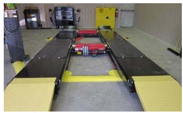
FCI Loretto's new automotive repair VT shop

FCI Loretto recently activated a new Advanced Occupational Education program in automotive repair. Twelve camp inmates who are within 24 months of release were selected to participate in the 650 hour (six month) program. The instruction is being provided through Greater Altoona Career and Technology Center. After the course has been offered for one year, the National Automotive Technicians Education Foundation will conduct an audit that will allow the program to be ASE-certified in the areas of suspension, electronics, general repair/maintenance, and brakes. FCI Loretto expects 24 students (two classes of 12 inmates) to complete the program annually.